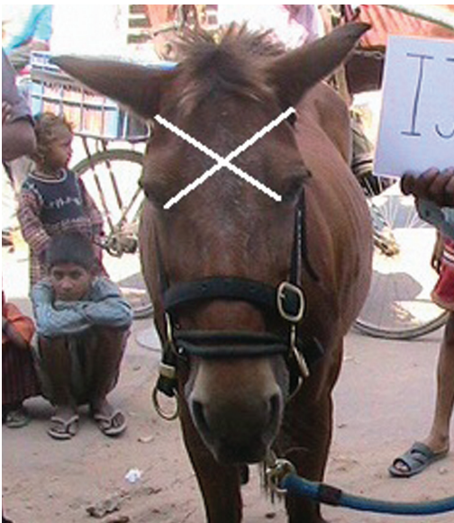
Figure 8.2.1 Imagine two lines drawn from the base of the ears to the medial canthi of the eyes. Aim to shoot a horse 2–3 cm above the place where the lines cross (white cross in photograph), and a donkey 1–2 cm above the cross.

Before using the penetrative captive bolt for euthanasia, staff must be trained both in using and maintaining it, and in the technique of pithing. Furthermore, all those present during this procedure should understand the procedure and that the animal may show violent reactions while being pithed (although this is purely due to brainstem destruction and no pain is experienced by the animal).