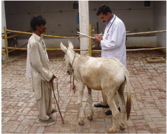
Figure 8.3.2 Consultation with the owner on the decision to euthanase, with written consent obtained.

It can be very difficult to persuade poor equine owners to euthanase their animals. Discussion highlighting the income loss, feeding costs and poor welfare of the animal can help to persuade owners. The owner's wife also played a vital role. The couple have since purchased a new animal.