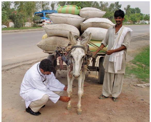
Figure 8.3.1 Initial examination at the roadside.

Rambo was in considerable suffering and pain, with multiple chronic conditions and an inability to continue working.