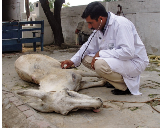
Figure 8.2.3 Check and confirm death of the animal.

To check the corneal reflex, touch the animal's cornea (surface of the eye). There should be no response if the animal is dead. The presence of any eye movement or blinking at this time is evidence of sustained or recovering brain activity; repeat the same or an alternative euthanasia procedure.