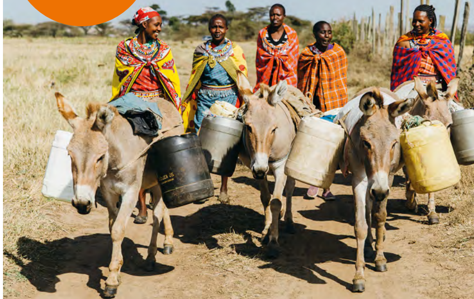
Members of an equine welfare group with their donkeys, Kenya.

An estimated TWO THIRDS of livestock keepers in developing countries are WOMEN