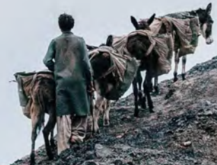
Coal mines, Pakistan.

We are incredibly grateful for any donation received, but the great thing about gifts in Wills is that they help us plan ahead. They ensure we can direct funds to the animals that need them most and focus on areas where we know working animals' needs are greatest.