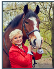
Angela Rippon, Brooke supporter

"Getting your Will organised can give you an enormous sense of satisfaction that after you've gone, you'll still be there for those who are most important to you. I know that by supporting Brooke in my Will, I'm going to be helping working horses, donkeys, and mules for many, many years to come."