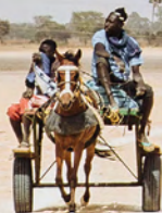
Working horse, Senegal.

This is just one of the ways a gift in your Will could play a powerful part in changing working animals' lives for the better, benefits which will be felt for years to come.